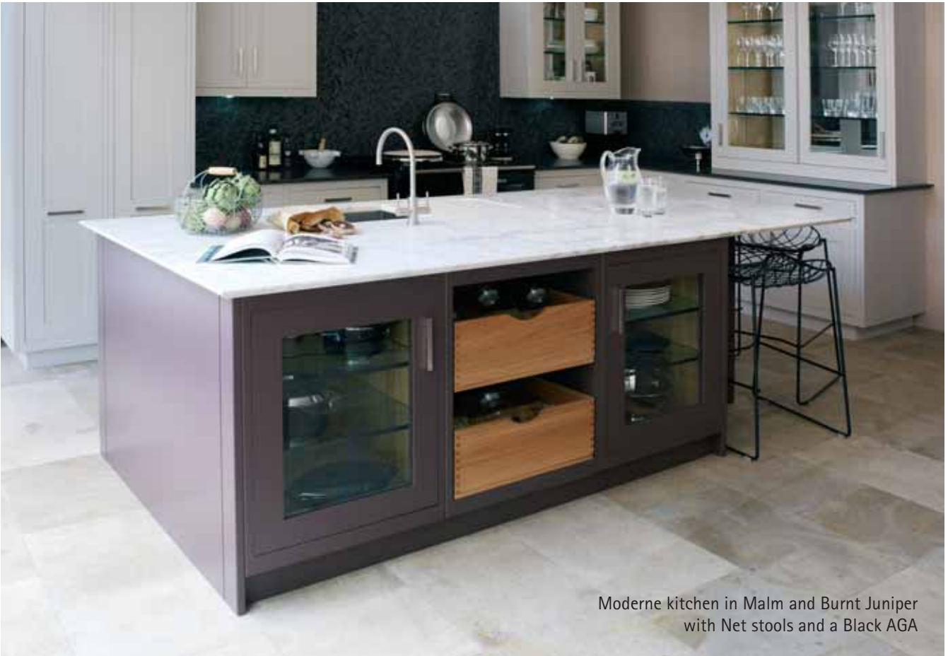
Moderne kitchen in Malm and Burnt Juniper with Net stools and a Black AGA