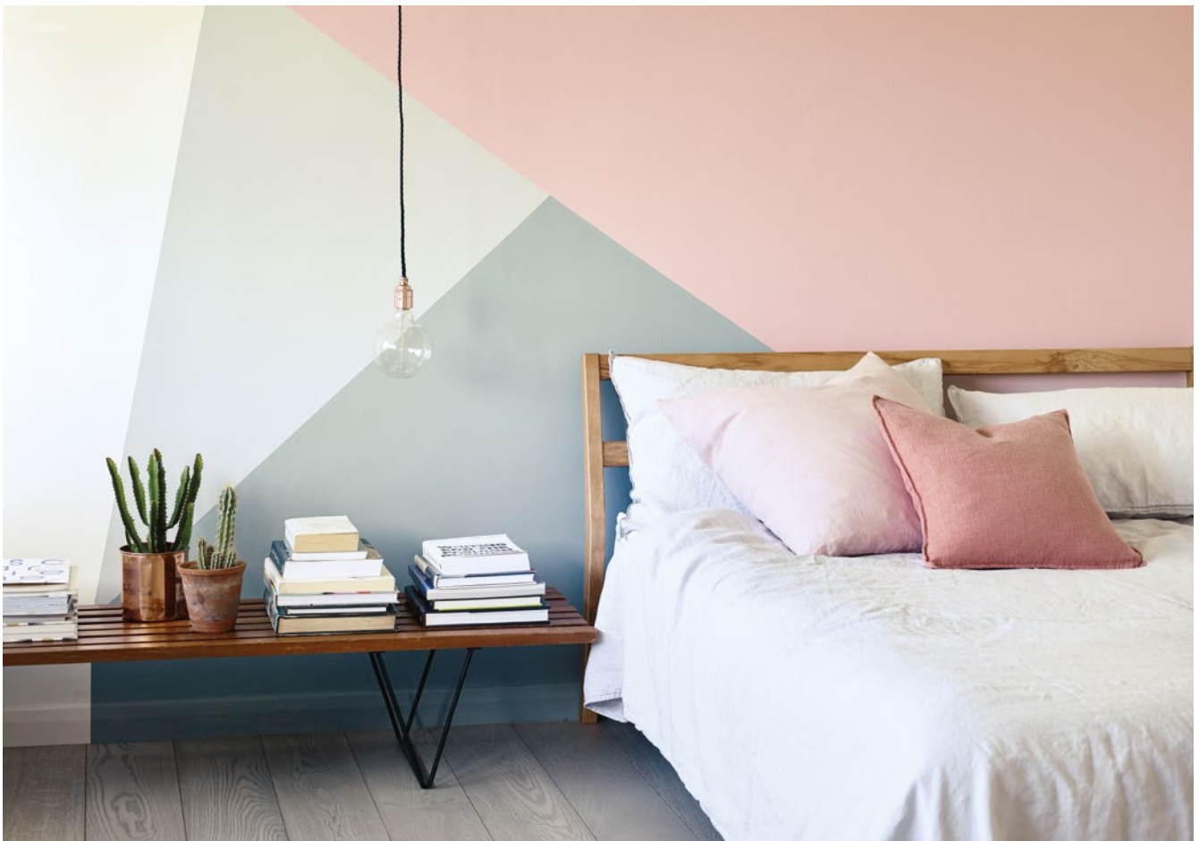
Wall painted in Storm , Orchard Pink , Graphite , Skylon Grey and Yes Your Honour paint.