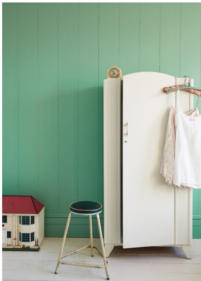
Left: Bone White paint. Right: Wall painted in Peafowl and wardrobe painted in Mockingbird .