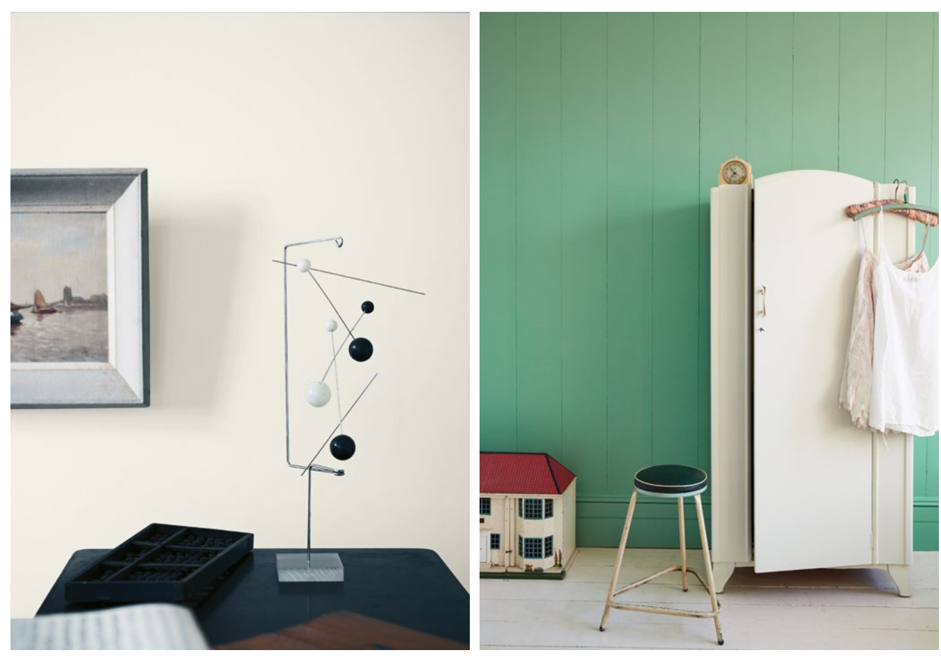
Left: Bone White paint. Right: Wall painted in Peafowl and wardrobe painted in Mockingbird.