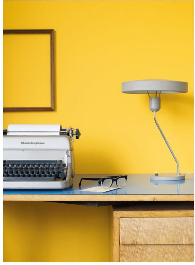
Aconite Yellow paint.