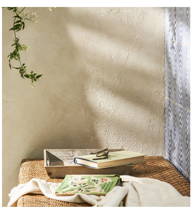
Left: South Bank. Right: Old Cream.