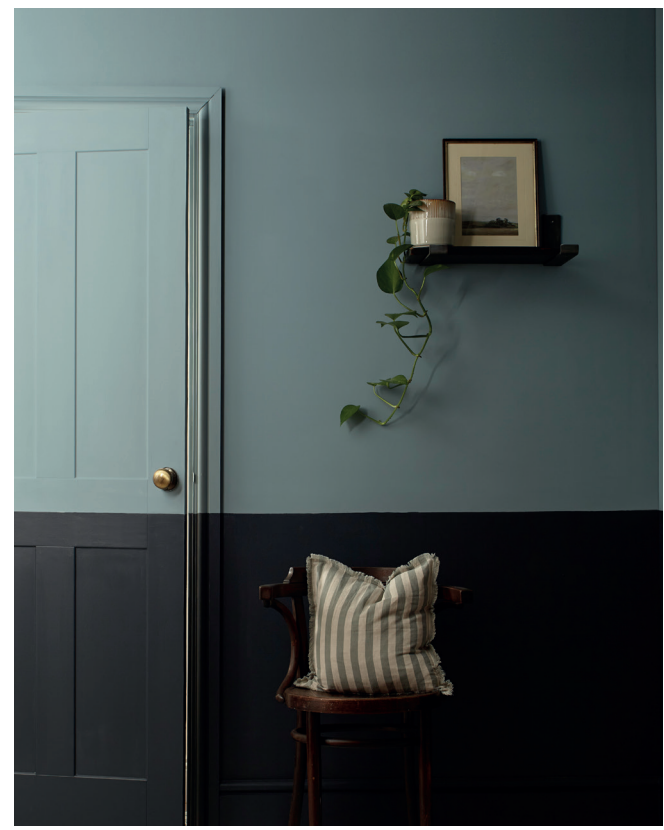
Left: Alabaster. Right: Storm & Top Hat.