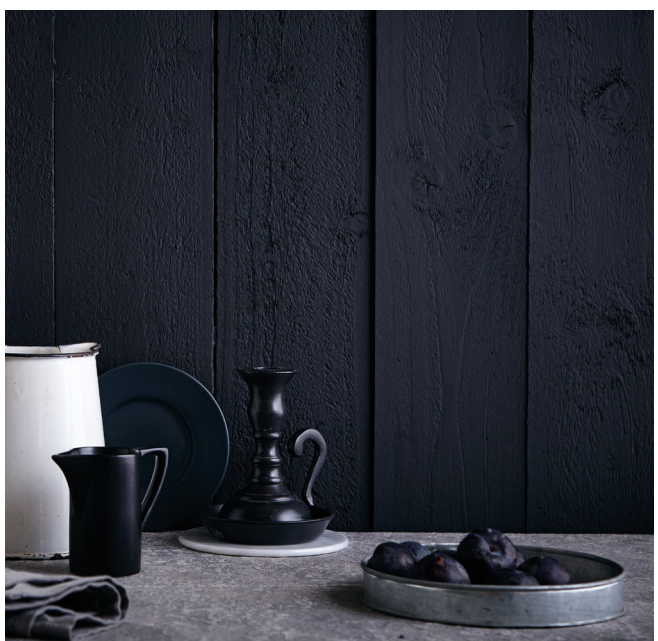
Left: Ecru. Right: Charcoal.